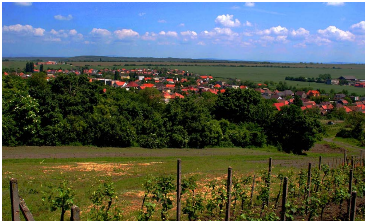
Horne Oresany, Podmalokarpatsky region (Slovakia) from the south.