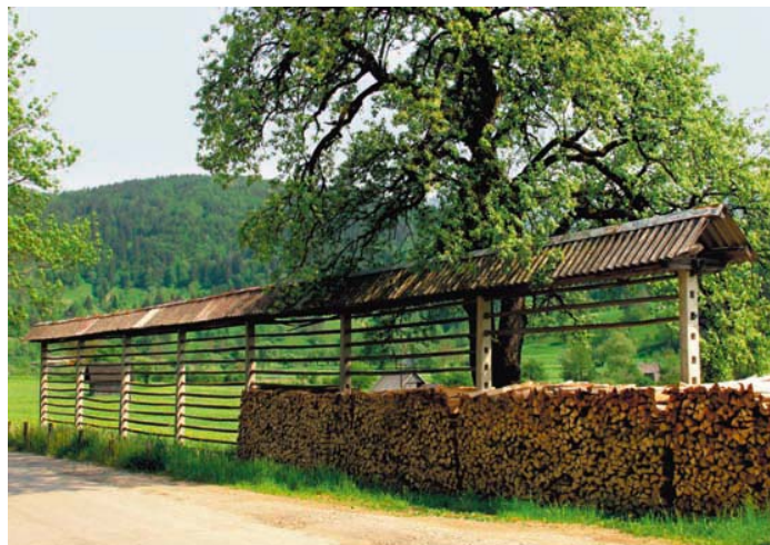
Historical landscape elements in Triglav National Park (Slovenia)