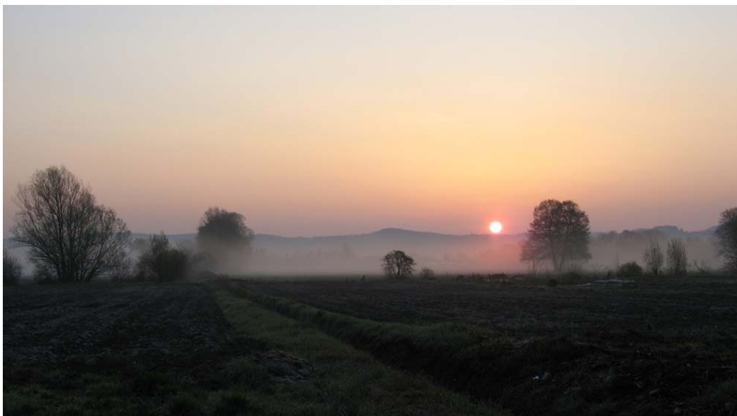
Ljubljansko Barje (Slovenia).

For the latest information, please visit www.vital-landscapes.eu .