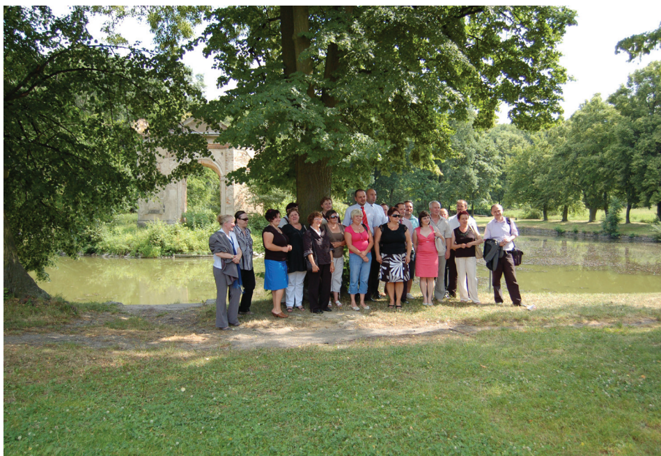
At the farm park in Part Nostitz