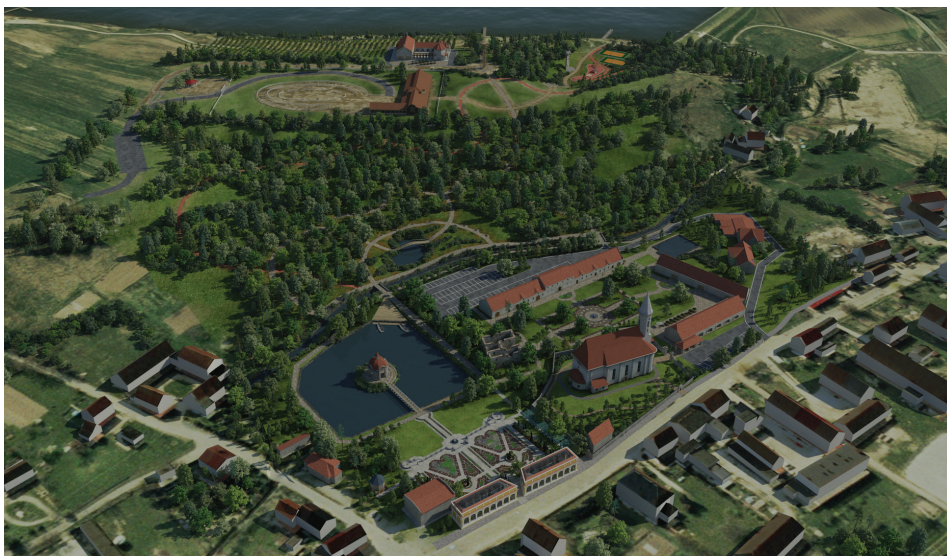
top: Lagoon in Mściwojowie