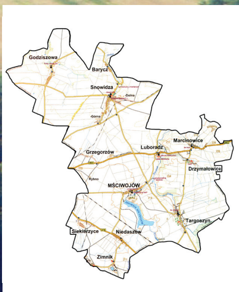
General map of the pilot area

Municipality of Mściwojów has been chosen as a pilot project region by the University of Agriculture in Krakow to elaborate a development scenario based on the natural and cultural heritage of the region. The project assumes the use of potential abilities of the municipality and elaborates a scenario based on the development and protection of cultural landscapes as a way to reconcile the needs of local people and the European Union Directive concerning cultural landscapes. In the centre of all works is the historical Nostitz family mansion with adjacent park and lake.