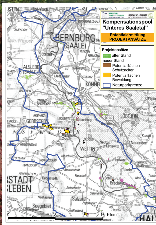
Map of potential compensation areas