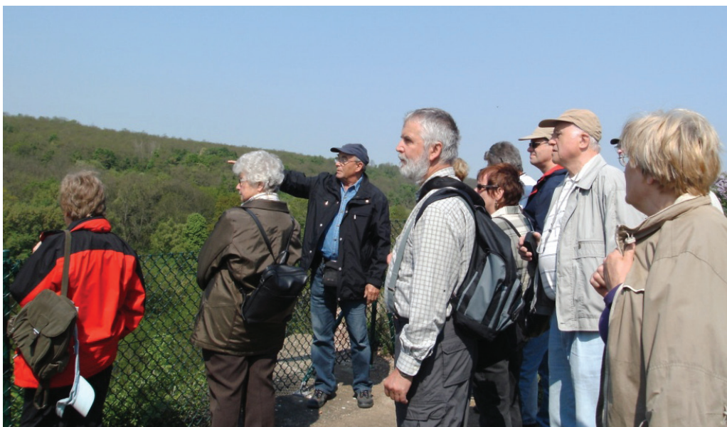
left top: Workshop outdoors left bottom: Cultural landscape guide in action right: View from Wettin hill