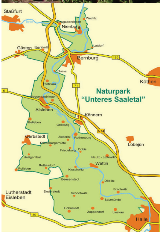
General map of the pilot area

The Lower Saale Valley offers a rich collection of cultural heritage. Along its ca. 50 km long way through the Nature Park the Saale river is the dominating landscape element, and it is an important anchor for regional identity as well. Situated between the largest cities and economic centers of the state Saxony-Anhalt, Magdeburg in the north and Halle/Saale in the south, the Lower Saale Valley itself is - apart from the city of Bernburg - out of the superior focus. For the main part it is up to the stakeholders and inhabitants of the region to make sure that Lower Saale Valley will be as vital as today also in the future. The VITAL LANDSCAPES Project will support them by providing new ideas, advanced knowledge and interesting international contacts.