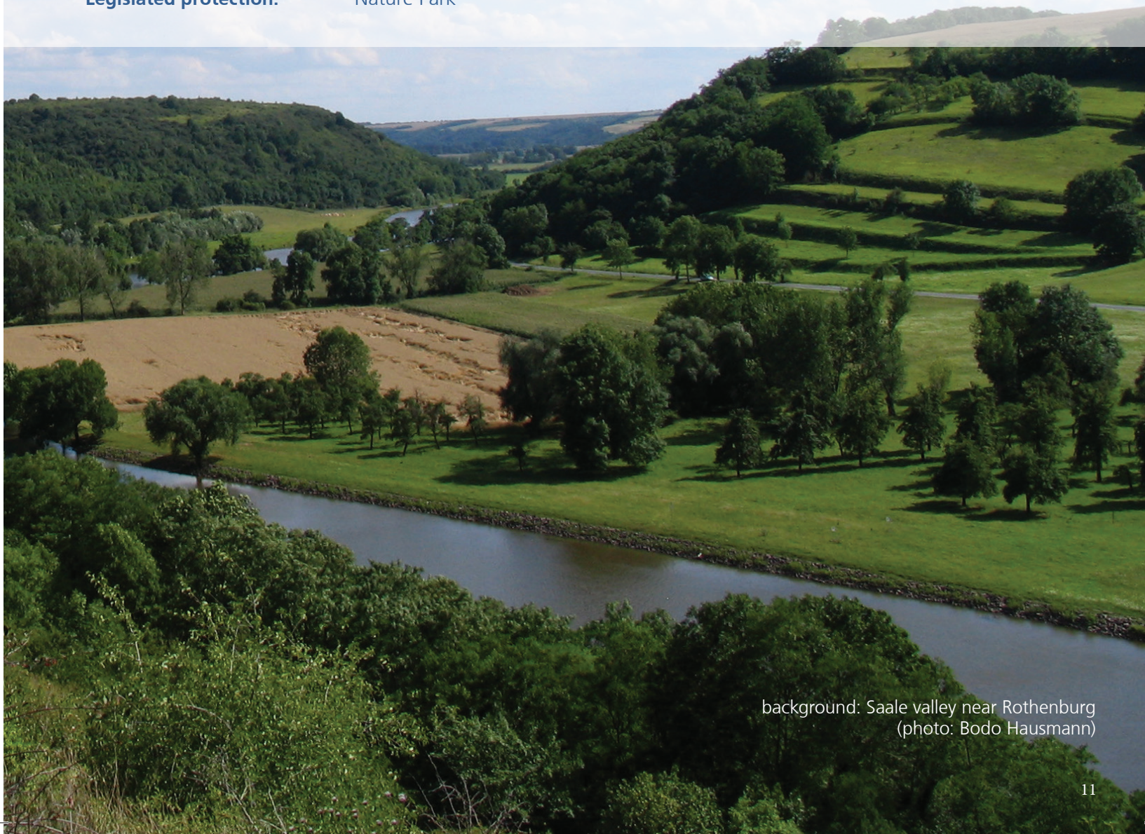
background: Saale valley near Rothenburg